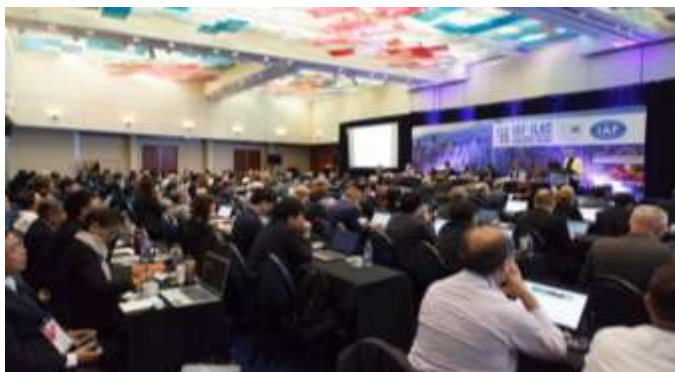
IAF GA in session

Membership and Signatories – Four organizations including the Foundation FSSC 22000 were admitted to the IAF Memorandum of Understanding (MoU) since the 2016 annual meetings held in New Delhi, India. The Arab Accreditation Cooperation (ARAC) was admitted as a regional accreditation group IAF MLA Signatory in the main scope: Management Systems Certification – ISO/IEC 17021-1; sub-scope: Level 4: ISO/TS 22003; Sub-Scopes: Level 5: ISO 22000; ISO 9001, ISO 14001. Four (4) accreditation bodies were admitted as MLA signatories for the various main scopes of Management Systems, Product and Personnel certification bodies including KENAS (Kenya) which was admitted in the Main Scope: Management Systems Certification – ISO/IEC 17021-1; Sub-Scope Level 4: ISO/TS 22003; Sub-Scopes Level 5: ISO 22000, ISO 9001, ISO 14001. Five accreditation bodies had their scope extended to the various main scopes of Management Systems (ISO 9001, ISO 14001, ISO /TS 22003 and ISO 27006, Product and Personnel certification bodies. This brought the total membership of the IAF to 106 comprised of 81 accreditation body members, 19 Associate members and 6 regional group members.