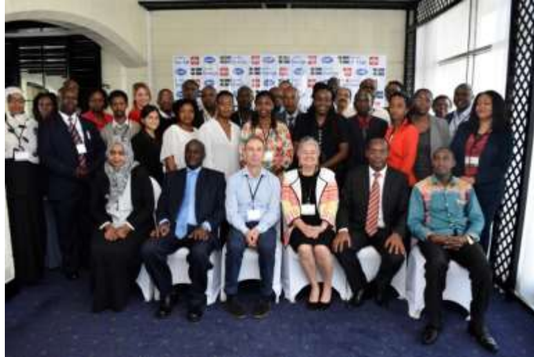
Participants from Sub-Saharan Economies and the Facilitators

In line with the frame work of the ISO Action plan for Developing Countries (APDC) 2016-2020, ISO in conjunction with the National Standards Body –the Kenya Bureau of Standards organized the regional training that drew 30 participants who were representatives of Accreditation Bodies, National Accreditation Focal points and National Standards Bodies from the Eastern and Southern African region. Members from Accreditation Bodies that were represented included SANAS KENAS, ENAO, Sudan Accreditation Council, MAURITAS, SADCA (Zimbabwe, Botswana, Mozambique, Zambia and Namibia). Representatives from other National Focal points included Uganda and Burundi.