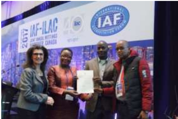
KENAS Team receiving the ILAC MRA Certificate

In the same month, KENAS was admitted as an ILAC MRA signatory for Testing (ISO/IEC 17025), Medical Testing (ISO 15189), Calibration (ISO/IEC 17025) & Inspection (ISO/IEC 17020). KENAS was also admitted as an IAF MLA signatory for Management System Certification – ISO/IEC 17021-1 with a Sub-scope level 4: ISO/TS 22003 and a Sub-scope level 5: ISO 22001, ISO 9001 & ISO14001. This laudable recognition came two weeks hot on heels of KENAS admission as a full signatory to the AFRAC MRA by the AFRAC.