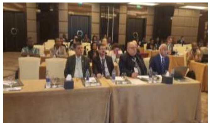
The 8th AFRAC GA in session