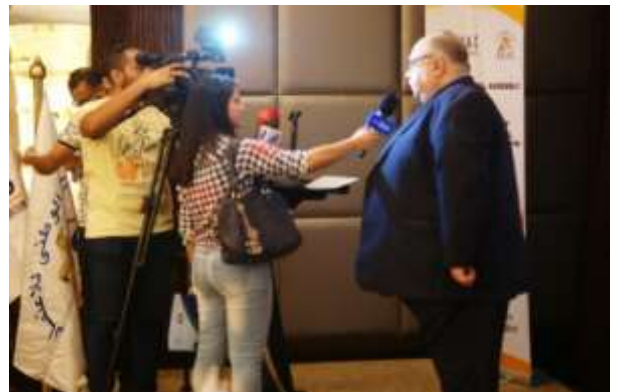
Hosting the AFRAC GA

EGAC official social networking account is published through Facebook with URL ( https://www.facebook.com/www.egac.gov.eg ).