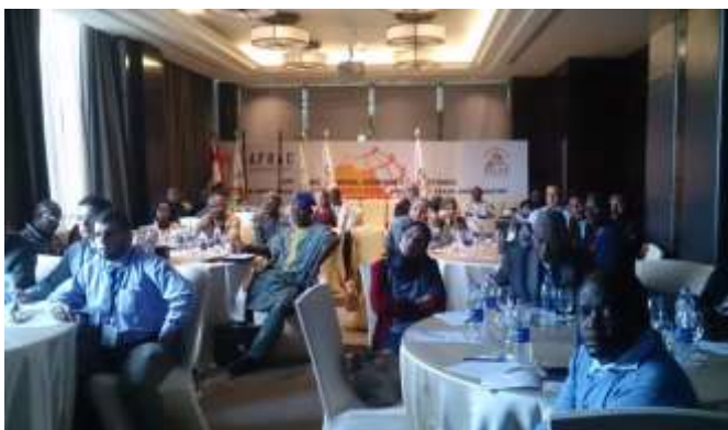
Attentive participants at the ILAC A3 Workshop