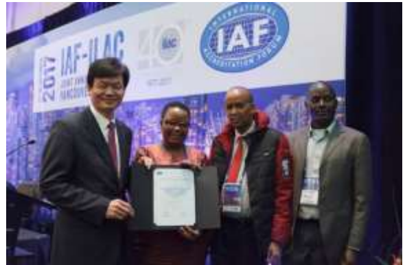
The KENAS Team receiving the IAF MLA Certificate

The MRA and MLA signatory status provides an opportunity for accredited Conformity assessment bodies to demonstrate equivalence and hence ensuring that businesses that depend on test, inspection, calibration, certification results have greater confidence in accredited test, inspection, calibrations reports and certifications that they rely on to make informed decisions. This also helps in facilitating trade since the equivalence that comes with accreditation of a conformity assessment body by an MRA/MLA signatory provides for one test, one inspection, one certificate accepted everywhere.