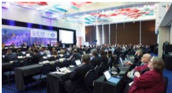
ILAC General Assembly in session