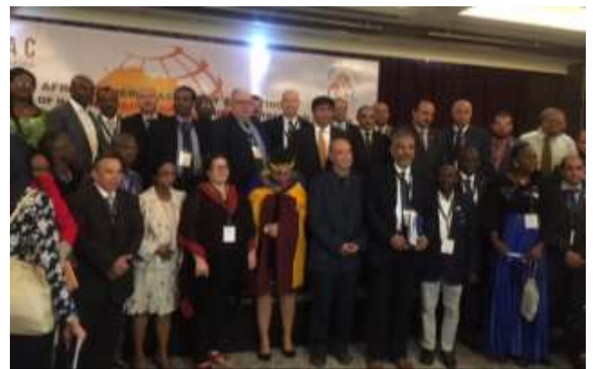
Delegates at the 8 th AFRAC GA opening Ceremony