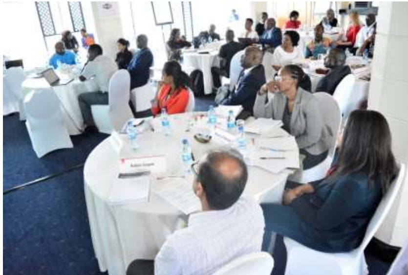
Workshop in Session

The forum provided mechanisms and techniques as well as discussions on recommendations to assist participants in implementation of accreditation requirements. In addition the participants were able to exchange experiences and network especially between Accreditation bodies and National Focal points.